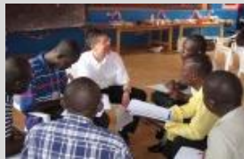
University of Liberia

AHED's mission is to help developing countries improve and expand their post-secondary institutions so that they can educate the professionals that the countries need for their development. It fulfills its mission by sending, academics and professionals, as volunteers, to provide expertise and foster the skills needed for these institutions.