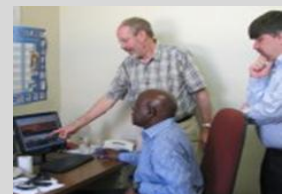
University of Namibia