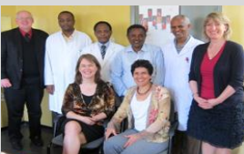
Addis Ababa University

If you are interested in signing up as a prospective volunteer, working pro bono with us here in Canada, or donating to AHED, please look at our website at